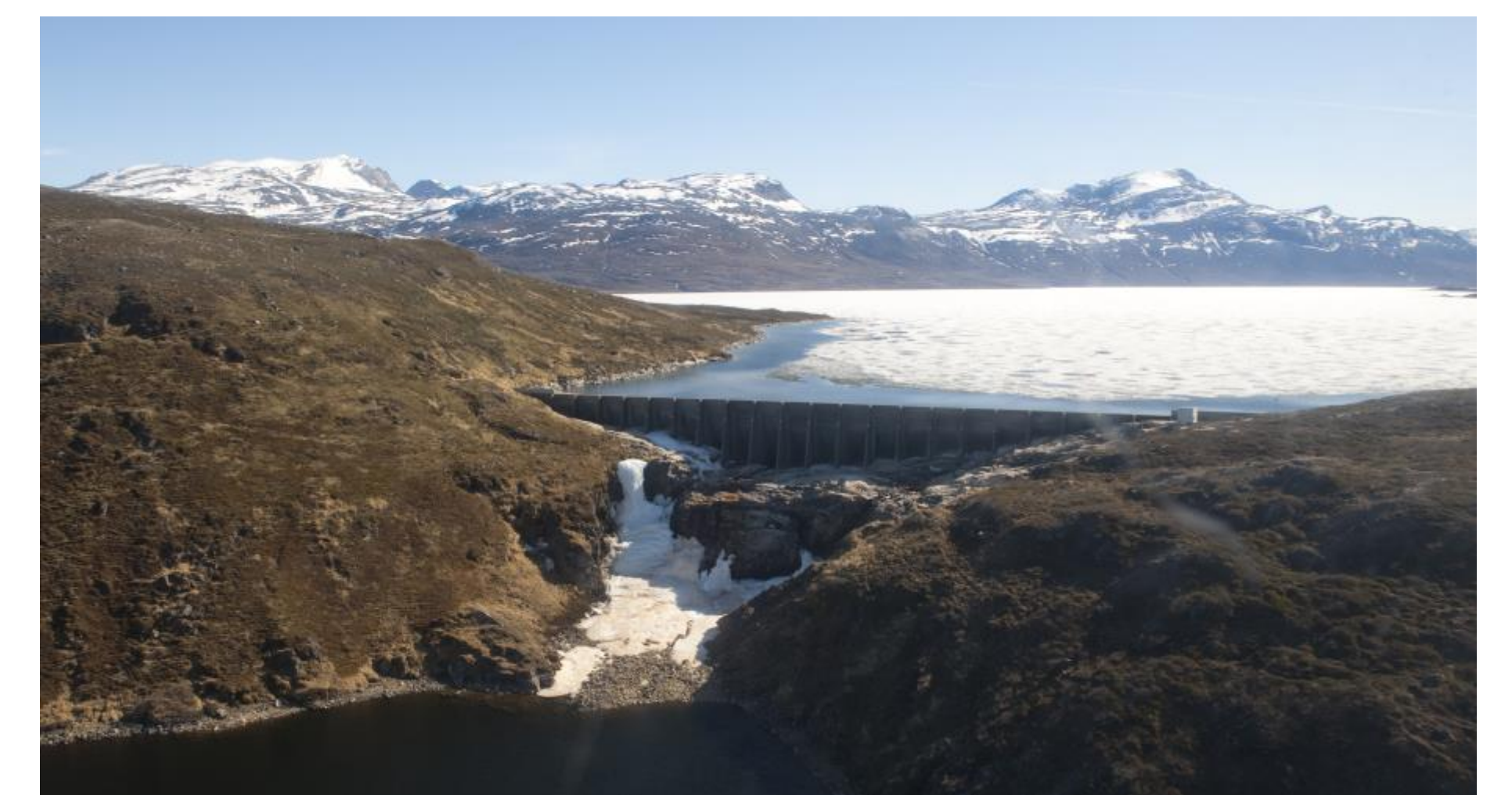
Photo 2: Hydropower source near the capital city Nuuk.