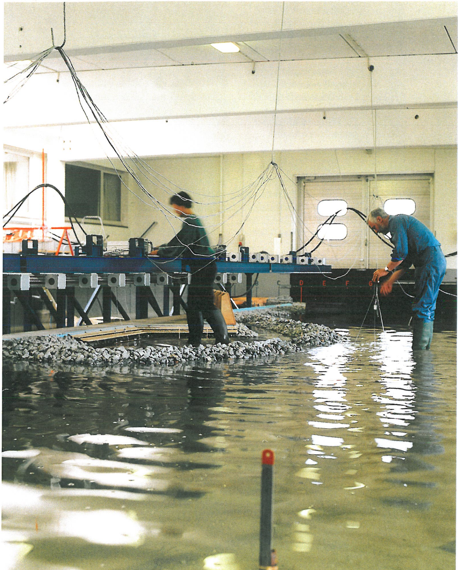
Wave basin with model test of breakwater extension of the »Kattegat Center« in Grenaa.