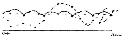
Music example 2:

In the first session I listened to channel 3 -- his emotional baseline as being very sad -- although he expressed verbally being very frustrated. In our pianoduet on the topic: "Allowing myself to try out the instrument -- searching around", he played alternately in the bass and the treble of the piano, not using the middle part. He played fragmented single tones, but gradually there arose some submission in his listening attitude to the music which were audible in his tones being more connected and him being more concentrated in his listening. He was surprised afterwards which he expressed verbally. I played small minor melodies (inspired by my listening to a sad mood in channel 3), which I gradually turned into a repeated softly-stroke note. It sounded almost like a heart beat and gave me something to hold on to, so I could stay fully in my musical interplay and simultaneously be listening in an almost embodied way -- channel 2 informing me of the need for a stable centre.