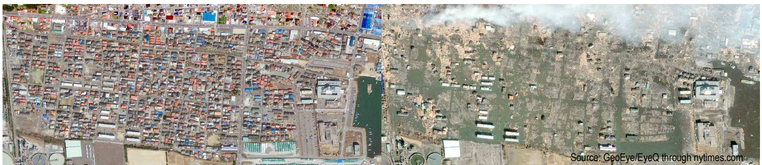
Before (L) and after (R) satellite images showing the impact of the tsunami north of Sendai

I have difficulty imagining life being the same for the FCA members in Shichigahama. With the expense of