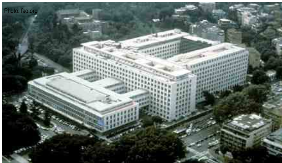
The FAO building, Rome