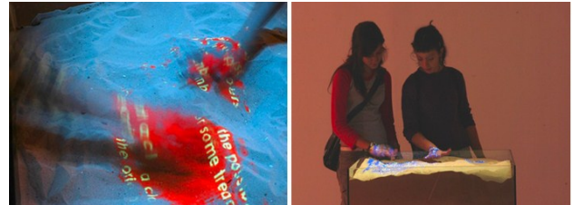
Figure 3. a. Books of Sand shows movement of hands in sand and text b. two people using the interactive space.

repelled by and attracted to each other, and the input pen, (Figure 2) forming phrases in response to user input. All text objects are tagged with information relative to the user’s pen, including the pen’s location. In this way, for example, short sentences are produced when the user draws a short line. In addition, as another example, in response to inactivity or delayed input, the work displays words and phrases on topics such as loneliness and dependency. In turn, when input is fast, the work displays related phrases such as speed or sampling error [18].