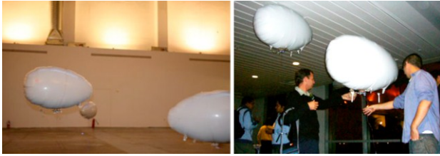
Figure 1. a. ALAVS at the site b. Participants feeding the ALAVs.