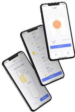
Figure 1: The Wound App.

The benefits of using the WoundApp need to be clear for patients, and engagement and involvement of health care personnel is critical to ensuring continued patient use of the app. The study indicated that the WoundApp increase compliance, empowerment, and knowledge among citizens. Challenges and barriers were identified, and an optimized WoundApp version will be tested in a decentralized clinical trial as a next step.