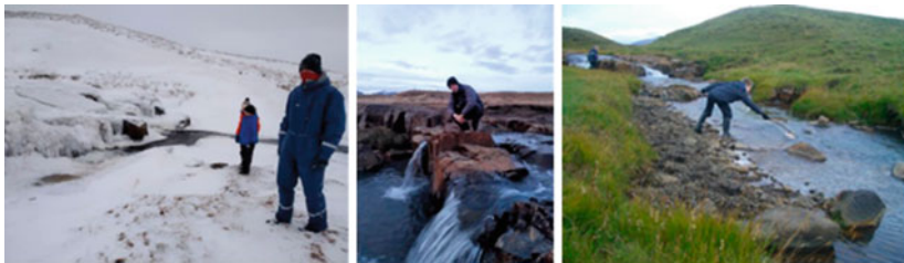
Fig. 5.2 The tourist experience: Torfalækur

Tourist performance is partly improvised, partly choreographed. We need to reproduce or cite particular performances in order to make them meaningful in a certain social context: to accomplish and secure the continuation of a given order (Edensor 2000; see Franklin 2012). Tourist destinations and attractions vary in how strictly ordered they are. While tourists invariably follow some kind of choreography or script, tourist performance also involves creativity and is shaped through an ambivalent relation between the intentional and unintentional (Edensor 2000). The stages of proximity tourism are often scripted as habitual rather than (spectacular) spaces for tourist consumption. The notion of proximity draws attention to the potential value that such spaces, steeped in the rhythms of everyday life, have in terms of the tourism experience (Fig. 5.2).