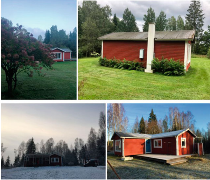
Fig. 5.1 The proximate gaze: Småland

rarely move outside a territory defined by the lake across the road, the creek below the house, and well-known trails in the surrounding forests. I have sat and stood on the rock down from the house so many times, walked in, along, and across the little stream below the house countless times. Besides walks in nearby forests, short rides or drives to the grocery store or a flea market, and the occasional jog, we usually stay on the grounds of the cabin, repeating the season-based practices we have undertaken for so many years: mowing, digging, and cutting, painting the house, relaxing in the sun, picking berries and mushrooms, and burning a fire.