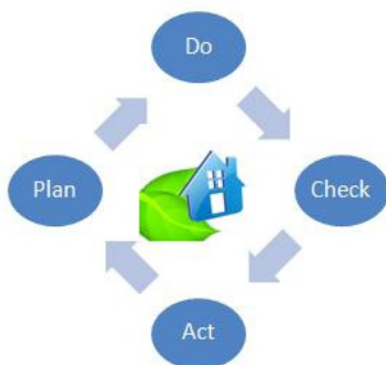
Figure 4: The PDCA-principle

In the SURE guideline, the indicators and requirements are chosen to be mostly quantitative. This will help the client to set measurable values for the project. As often happens, the requirements for the refurbishment are qualitative and cannot be measured in the operational phase. Then, the users and the building owner have too few figures in the operation phase to benchmark from the planning process. This is of high relevance, especially for indicators like energy use, CO 2 -concentration and day light factor. To try to give a helpful tool for planning, setting requirements, measuring and to form procurement documents, the SURE guideline is using the principle of PDCA; Plan, Do, Check, Act (figure 4). PDCA is an iterative four-step management process typically used in business. It is also known as the Deming circle/cycle/wheel, Shewhart cycle, control circle/cycle, or plan-do-study-act (PDSA). The concept of PDCA is based on the scientific method, as developed from the work of Francis Bacon [7]. The scientific method can be written as "hypothesis"- "experiment"- "evaluation" or plan, do and check. The four steps could be described as in the following: