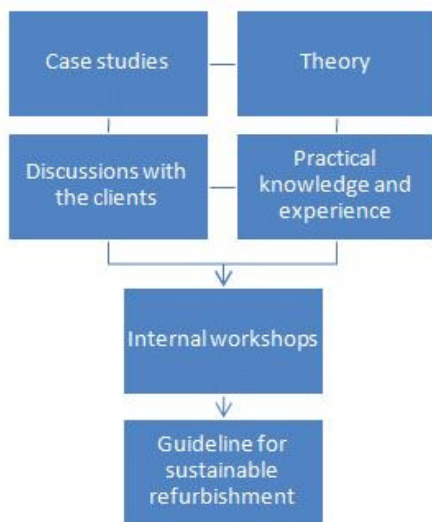
Figure 1 shows an outline of the methodology used in this study. 10 different case studies in Denmark, Finland, Norway and Iceland are investigated in order to find sustainable solutions for refurbishment. Further, thorough discussions with the clients regarding ambitions, strategy, energy reduction, future use and a lot of other parameters have been conducted. For several of the case

studies, a condition survey has been carried out to get an overview of the performance of the building(s). Thereafter, discussions on recommended measures, overall client strategies, procurement strategies, client as a change agent and the use of guidelines in the specific refurbishment project are summarized in a case study report. The guideline on early phase planning here described has been created based on findings and conclusions in the case studies, internal and client-specific discussions/workshops combined with the researcher's theoretical and practical former experiences and knowledge in refurbishment of buildings. The guideline contents and structure is created through internal discussions and brainstorming in workshops in the SURE research project.