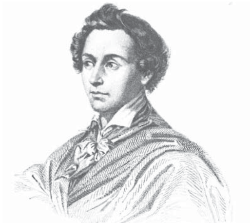
Antonin Carême (Willan (1977):129)