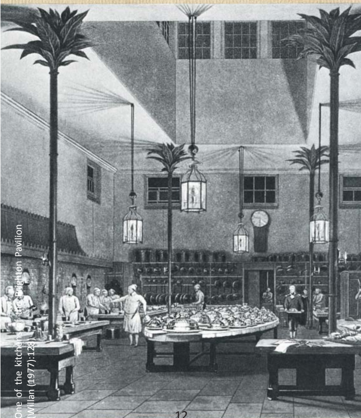
One of the kitchens of the Brighton Pavilion (Willan (1977):128)

At that time a pâtissier was on equal terms with the chefs in the internal kitchen-hierarchy.