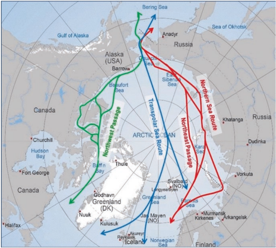
Fig. 11.2 Arctic shipping routes. (Czeslaw Dyrz 2017)