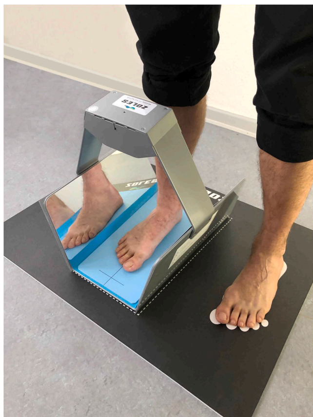
Fig. 2. Example of foot scanning process of a right foot using the DOMEscan/IBV 3D scanner.