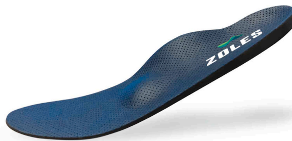
Fig. 1. Zoles 3D-printed insole exemplar.

Participants allocated to the control group are a "do-as-usual" comparator. This implies, that the participants may treat and prevent running-related pain and discomfort in any way they wish, including any existing use of orthotics, except using Zoles 3D-printed insoles.