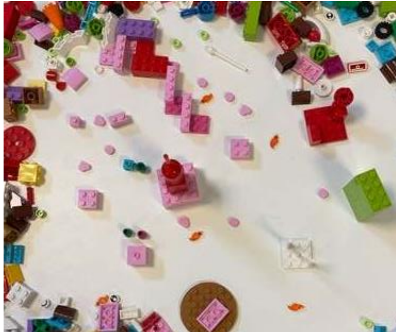
Picture 6 The team explored the vision of a cultural venue becoming a lighthouse (center) “illuminating” a network of activities, elements or institutions supporting similar values across the city