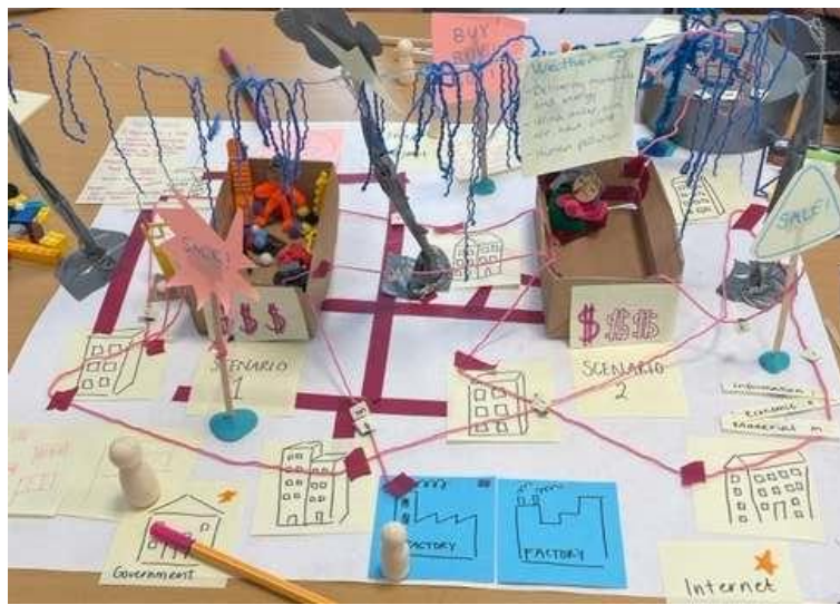
Picture 5 Prototyping the system revealed the storage spaces available that became an asset of their solution.

The solutions proposed by the participants reflected strategies for transforming the targeted systems based on some of the concepts mentioned in the three reference studies of this paper. Several teams' solutions leveraged strategic aspects of the system that could have a transformational ripple effect in the system. An example of this could be the team that leveraged existing abandoned storage spaces in the city for more sustainable use of resources and circular urban ecosystems (picture 5).