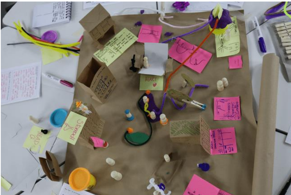
Picture 3 A team used the metaphor of a body to explore the urban system they targeted and identify potential challenges to address.

One of the groups depicted the targeted system as a human body. They represented a heart, a brain, hands, and lungs, generating analogies between the organs and the different parts of the urban context. As they explained, thinking of the urban system as a human body compound of organs with specific functions that also operate together in a bigger system enabled conjectures on innovative ideas and a shared understanding of the necessity of developing solutions that performed on the individual level and in coordination for a bigger cause. For example, the group asked themselves about the lungs, rising questions on how to ensure that the urban space could breathe and re-oxygenate (Picture 3). In that manner, they uncovered some lacks or needs within the system that they could act upon. Later, while presenting their proposals, they considered the urban system as a whole body, reflecting on how certain solutions would affect other "organs".