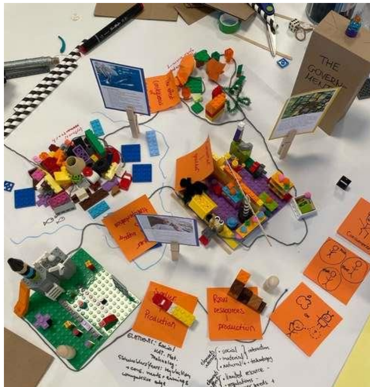
Picture 1 Representing the system through exploratory prototyping helped participants to visualize the complexity they were working with and conceive solutions to act on it

In particular, prototyping was highlighted for helping "visualise the abstract problem into something tangible to work with". This visualisation contributed to making their ideas "easier to relate to", expand their "perspective on certain areas of the system" they were not aware of, and pay more attention to the "environment affected by their solution". For example, picture 1 belongs to a group that worked with the interrelated challenges of waster in the city and overconsumption. When prototyping, they started from materializing a shop, which then lead to unfold and represent the supply chain of products and their after-purchase life. In this way, they uncovered more specific challenges in the system and planned a portfolio of solutions to alleviate them.