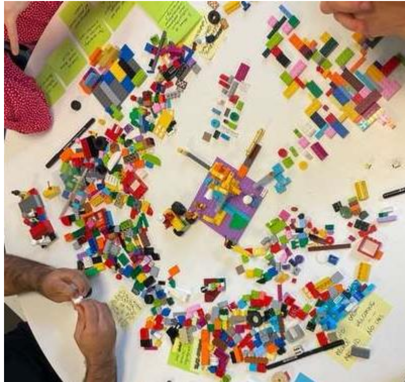
Picture 4 A team prototyped their vision of a system, envisioning solutions according to Elinor Ostrom's concept of "governing the commons"

Participants also acknowledged the influence of prototyping in supporting envisioning processes. Particularly, some expressed that prototyping was useful when "thinking about alternative directions" and imagining together "more vividly their visions for the future" as a departure point for ideation. They reported that collaborative prototyping was "a good way to base ideating on some clear visions, rather than coming up with the idea and then see if it solves bigger issues".